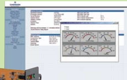
Optional Liebert IntelliSlot Web Card provides SNMP and web-based management